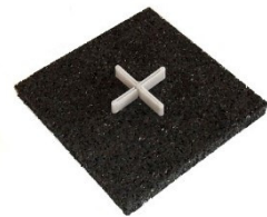
Low Noise Rubber